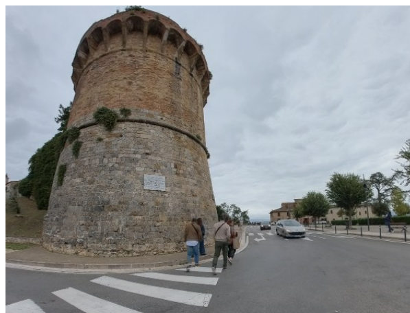
Figure 8 From Parking P2 towards the center