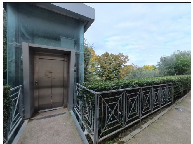
6 Elevator of the P3 Bagnaia Superiore car park

Progetto realizzato con il contributo della