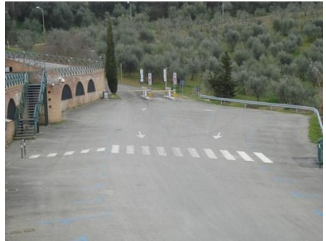
4 Parking P4 Bagnaia inferiore