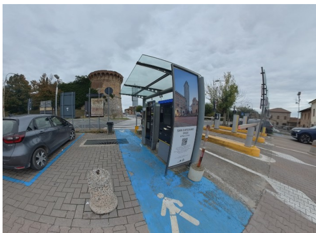
Figure 7 Parking P2 Montemaggio