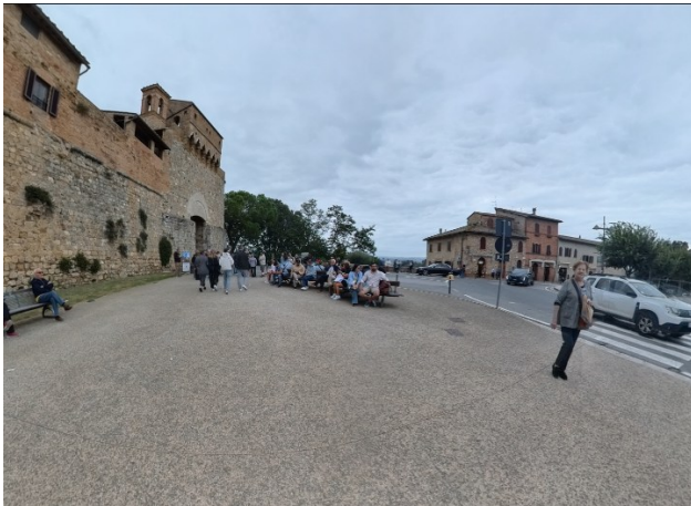
Figure 11 Towards Via S. Giovanni