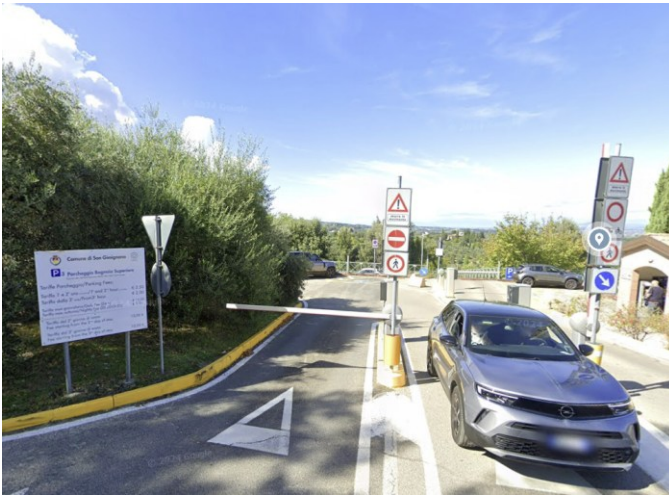
3 Parking P3 Bagnaia Superiore