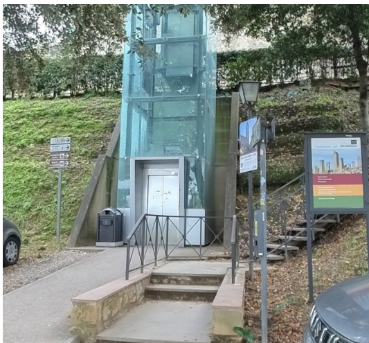
5 Elevator of the P3 Bagnaia Superiore car park