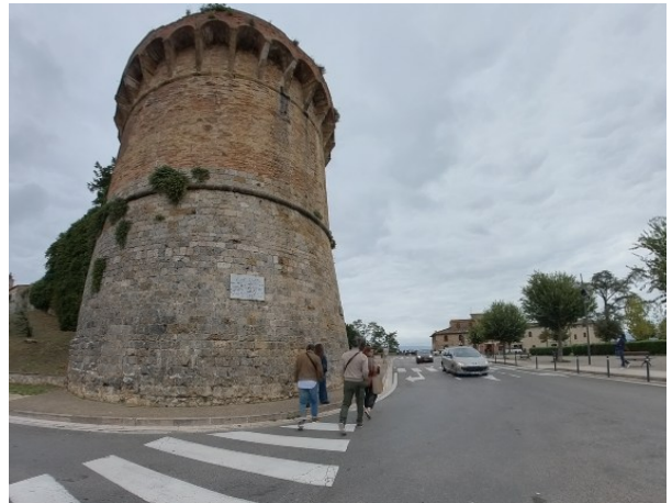
Figure 10 From Parking P2 towards the center