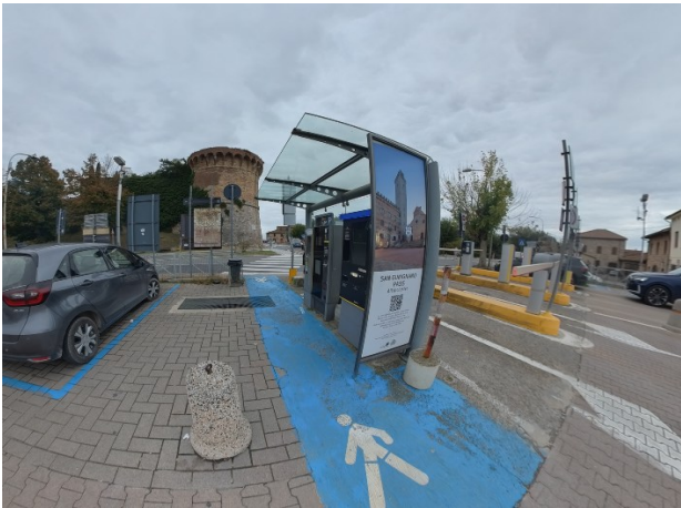
Figure 9 Parking P2 Montemaggio