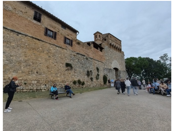
Figure 12 Through the door in Via S. Giovanni