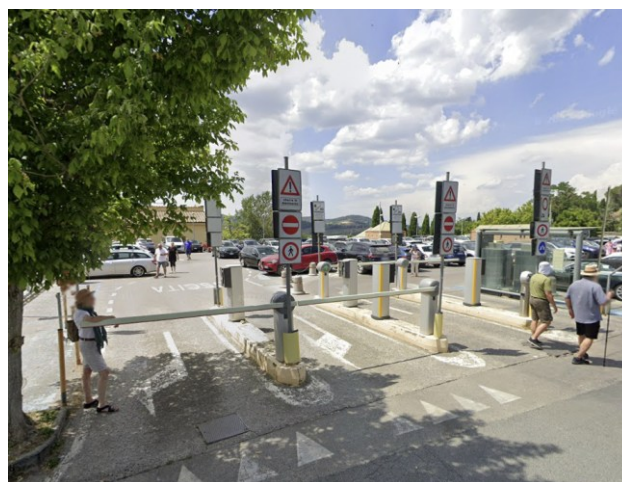
2 Parking P2 Montemaggio