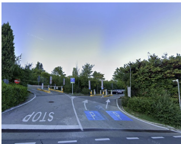
1 Parking P1 Jubilee